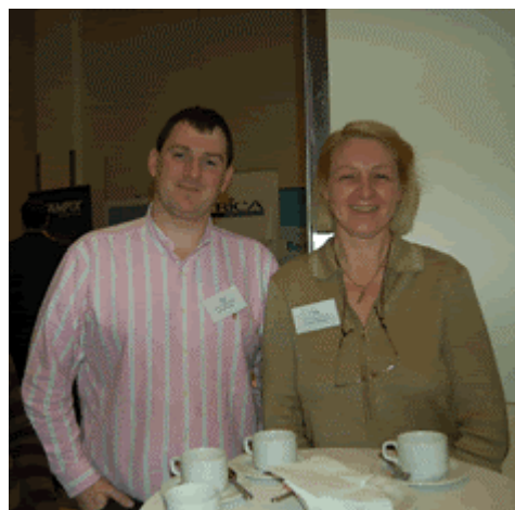
GP Trainers at the GP Trainers Workshop in February 2007